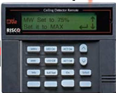
Optional Bi-directional Infrared Remote Control